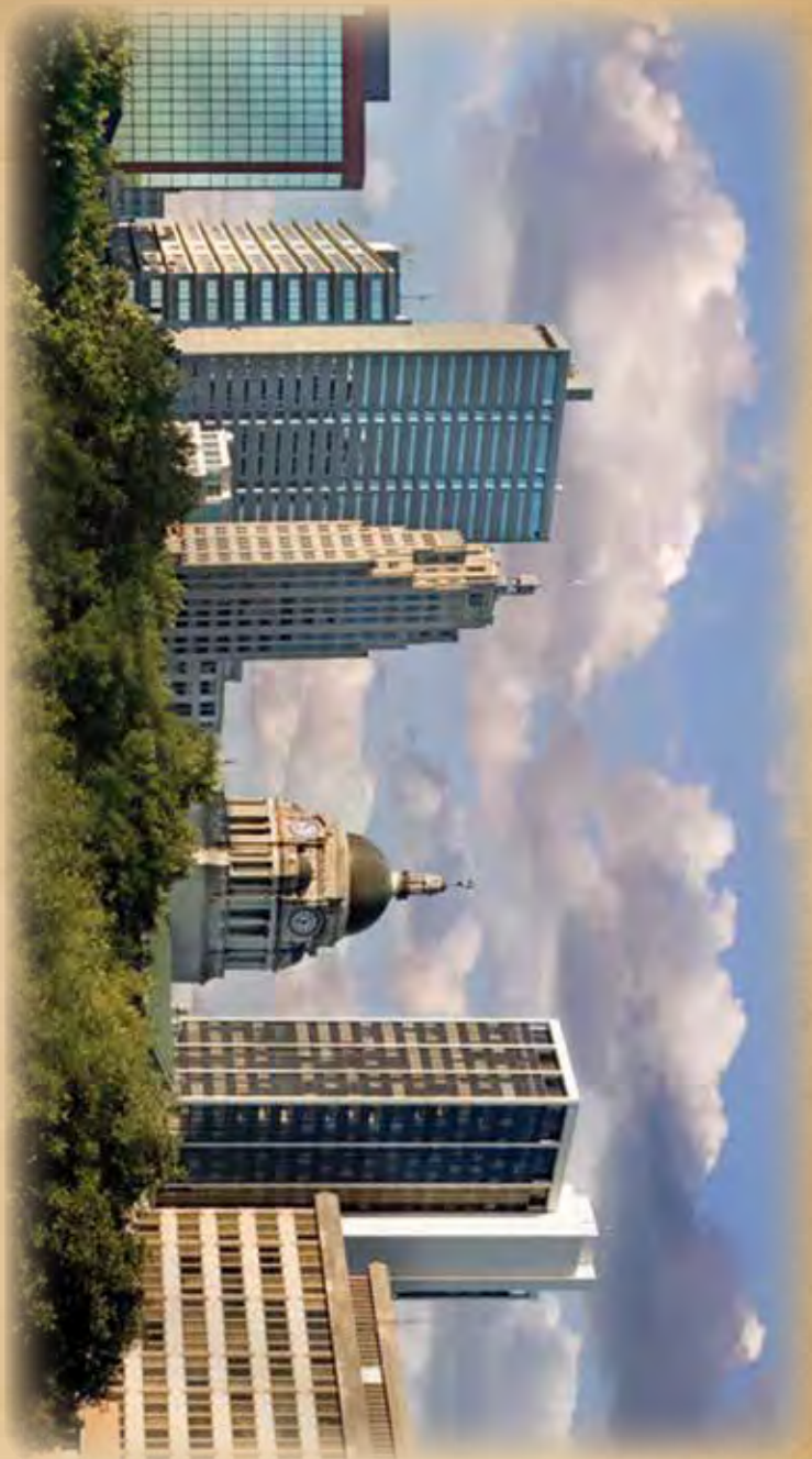
Fort Wayne, Indiana